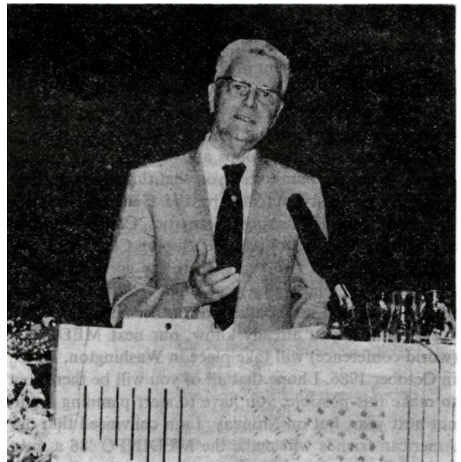
Picture 2. Nobel Laureate Dr. Jan Tinbergen delivering the key note speech.